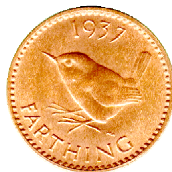
Fig 1: Wren Reverse Design