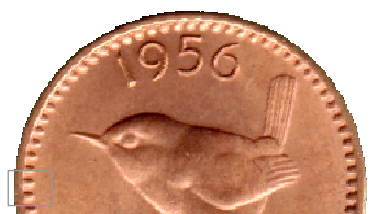
Fig 8: Longer Edge Beading