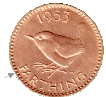
Fig 6: QE 2 Reverse - Type A