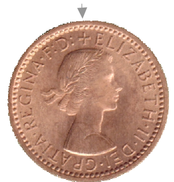
Fig 5: QE 2 Obverse - Type 2