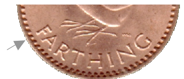
Fig 7: QE 2 Reverse - Type B