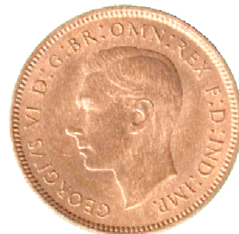
Fig 2: KG VI Obverse - Type 1

Reverse: Wren image facing left, date above and "FARTHING" below.