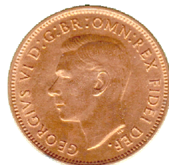
Fig 3: KG VI Obverse - Type 2